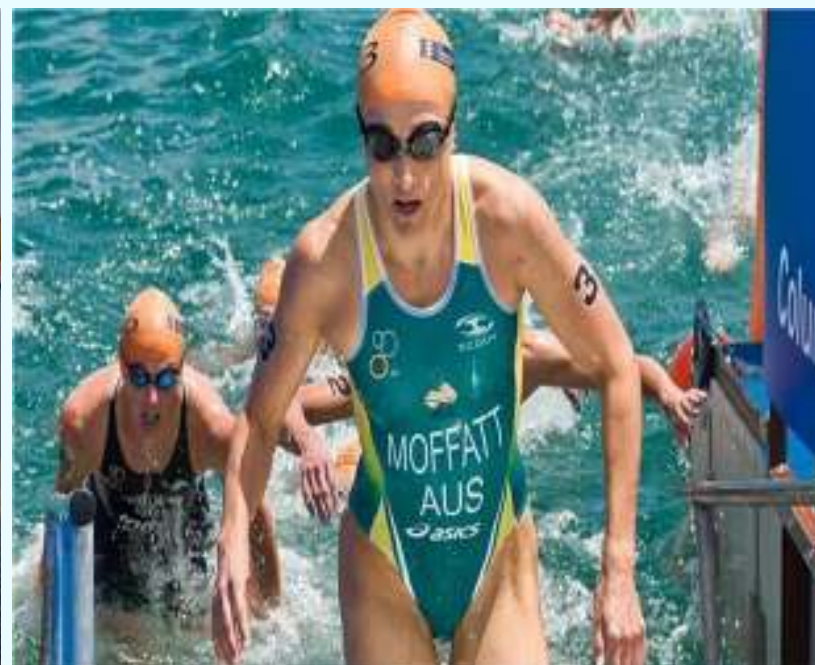
Hyde Park, London