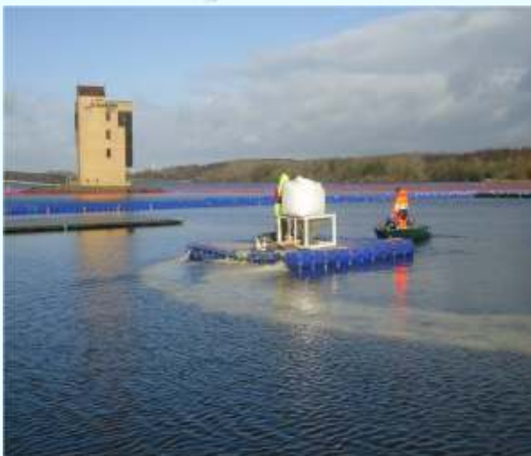
Strathclyde Loch, Scotland