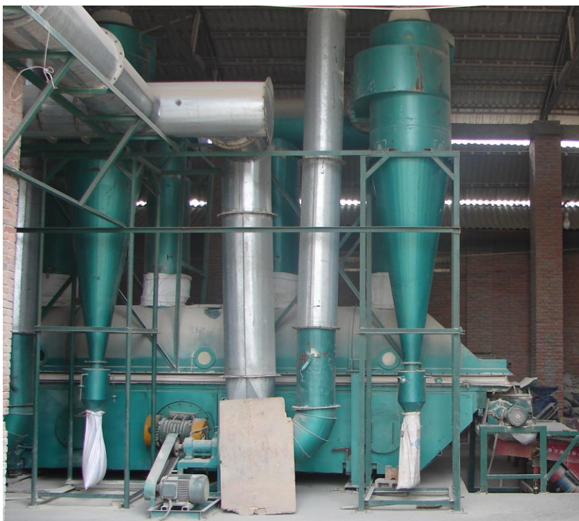
Figure 3: Packaging dry, free flowing granular Phoslock ® in the factory at Kunming, China.