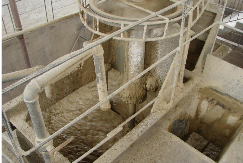
Figure 1: Mixing bentonite clay and lanthanum chloride at the Phoslock ® manufacturing factory in Kunming, China.

that, during the manufacturing process, the lanthanum content of the Phoslock ® granule is 50 \pm 2 mg/g i.e. 5% ( \pm 0.2\% ).