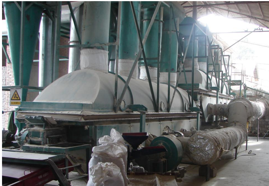
Figure 2: Dewatering and drying processes during the Phoslock ® manufacturing at Kunming factory, China.